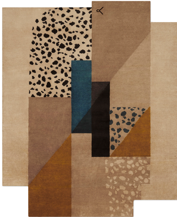
Art Deco 2 - Brown

Inspired by the geometric architecture and rich colors of the Swedish Grace era. A significant Scandinavian design movement that drew inspiration from neoclassicism and art deco.