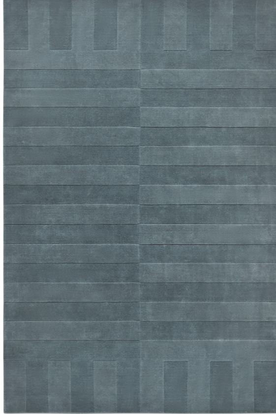
Lux 2 - Petroleum

Inspired by the classic elegance of mid century art and design. Made in a solid color but cut with a two millimeter difference in pile height creating an understated and clean pattern. This plush cut-pile rug is made with New Zealand wool for great quality and a soft feel.