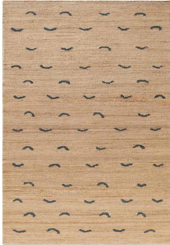
Jute Wave - Teal

The Jute Collection is woven with strong all-natural plant fibers in a modern rustic design. Equally as rugged as minimalist. Available in three different patterns using our signature cream, teal, and black colors as accents. The rugs are a beautiful foundation to any room, whether it's in the countryside or in the city. Each rug is handwoven with irregular details to create beautiful imperfections that make each rug unique. The rugs are tough and durable with a texture that ages beautifully.