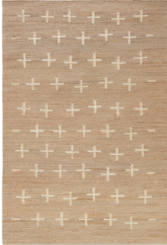
Jute Cross - Cream

The Jute Collection is woven with strong all-natural plant fibers in a modern rustic design. Equally as rugged as minimalist. Available in three different patterns using our signature cream, teal, and black colors as accents. The rugs are a beautiful foundation to any room, whether it's in the countryside or in the city. Each rug is handwoven with irregular details to create beautiful imperfections that make each rug unique. The rugs are tough and durable with a texture that ages beautifully.