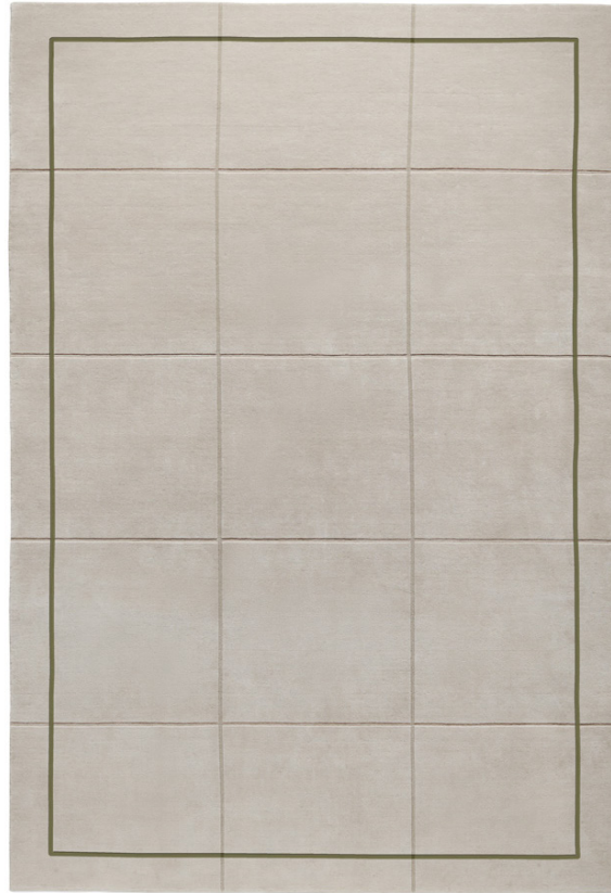
Norr Mälarstrand 02 - Oatmeal/Green

Designed by Swedish architect Andreas Martin Löf for his living and work space in Norr Mälarstrand, Stockholm. Inspired by the typical "Norr Mälarstrand" aesthetics where the architecture lies on the border of classicism and modernism. The rugs patterns are based on elements and colors from the building in green and a soft greige with black accents.