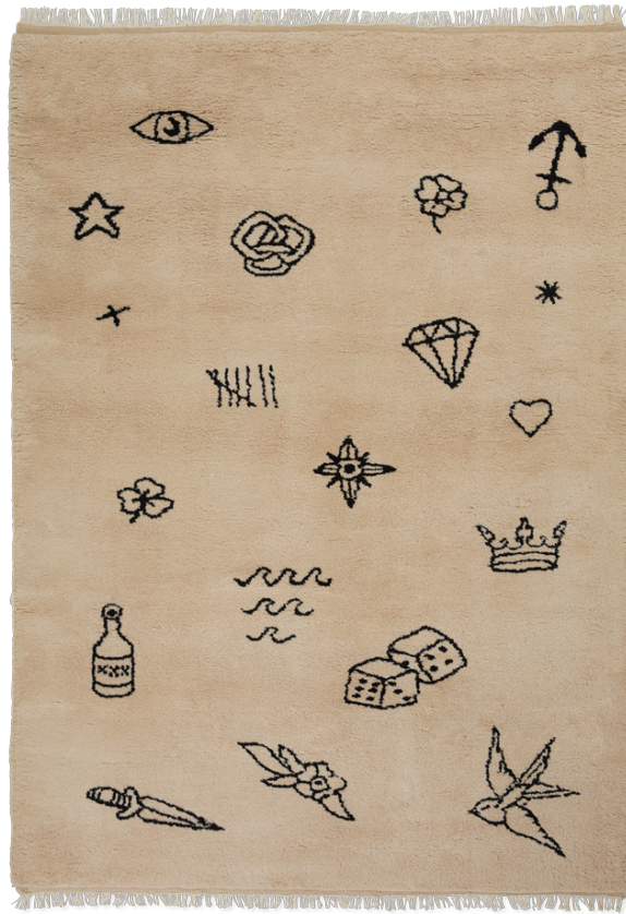
Nomad - Sand

Inspired by the heritage of Nordic nomadic tattoos we have collaborated with renowned tattoo artist Erik Löf of Stockholm Classic Tattoo Studio to create a unique design for the home of modern nomads around the world. The Nomad Collection is hand-knotted with high quality wool. With a shaggy 42 mm wool pile for a cozy feeling. Wherever you have been and wherever you are going, the Nomad rug will make you feel right at home.