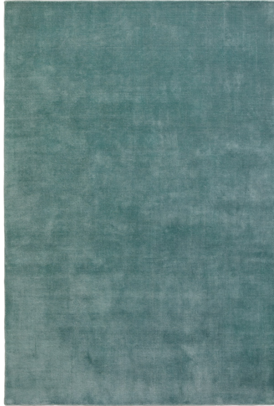
Grand - Pale Green

The Grand Collection is made to create a hotel-like feel in your home. The collection comes in luxurious yet contemporary colors; Dusty White, Silver, Brick Red, Rich Blue and Pale Green. The cut-pile design creates a beautiful soft aesthetic, as pleasing for the eye as for your feet. So you can walk, sit, lie, or dance around on a colourful, plush, rug all day.