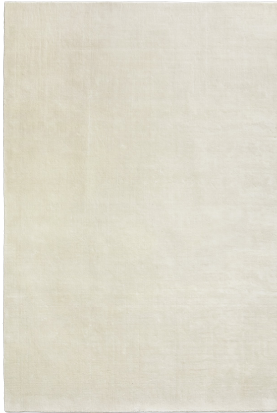
Grand - Dusty White

The Grand Collection is made to create a hotel-like feel in your home. The collection comes in luxurious yet contemporary colors; Dusty White, Silver, Brick Red, Rich Blue and Pale Green. The cut-pile design creates a beautiful soft aesthetic, as pleasing for the eye as for your feet. So you can walk, sit, lie, or dance around on a colourful, plush, rug all day.