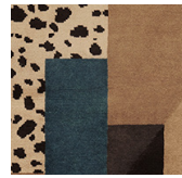
Art Deco 2 - Brown