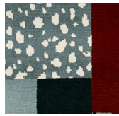
Art Deco 1 - Blue