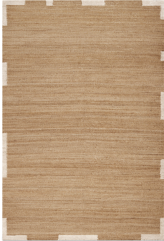
Jute Edge - Cream

The Jute Collection is woven with strong all-natural plant fibers in a modern rustic design. Equally as rugged as minimalist. Available in three different patterns using our signature cream, teal, and black colors as accents. The rugs are a beautiful foundation to any room, whether it's in the countryside or in the city. Each rug is handwoven with irregular details to create beautiful imperfections that make each rug unique. The rugs are tough and durable with a texture that ages beautifully.