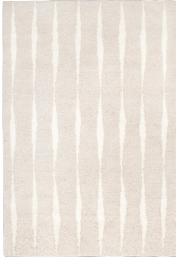
Fjord - Pale Sand

A fjord or fiord is a long, narrow inlet with steep sides or cliffs, created by a glacier. This design is inspired by the Norwegian coastline and it's estimated 1,200 fjords. This shaggy rug is made with New Zealand wool for great quality and a soft feel.