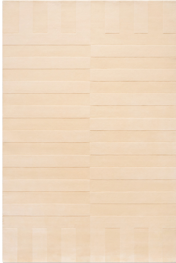
Lux 2 - Dusty Apricot

Inspired by the classic elegance of mid century art and design. Made in a solid color but cut with a two millimeter difference in pile height creating an understated and clean pattern. This plush cut-pile rug is made with New Zealand wool for great quality and a soft feel.