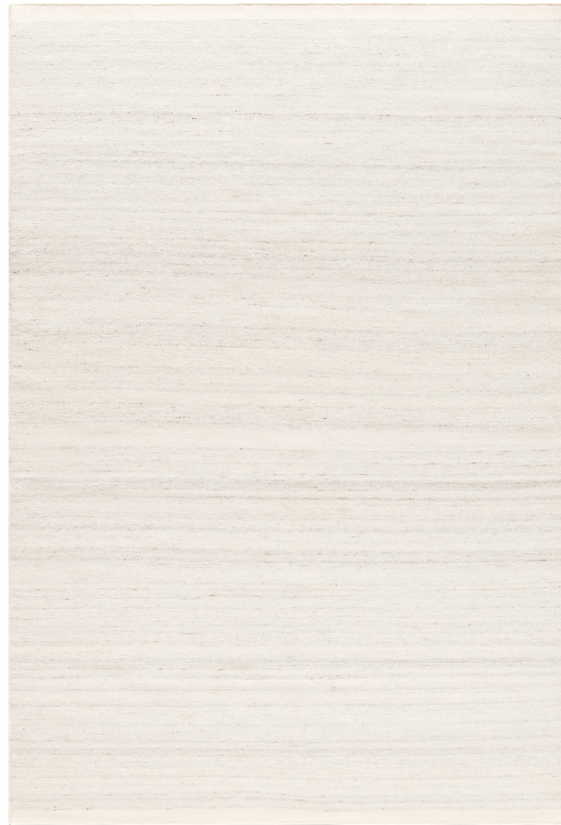
Zero - Cream Mix

The Zero Collection is a celebration of wool in its most pure state. Durable hand woven rugs made with great quality European wool, with zero dye — uncolored — to reveal the natural characteristics of the raw fibres. This timeless minimalist statement comes in five different shades, and the secret recipe behind each is simply different colored sheep.