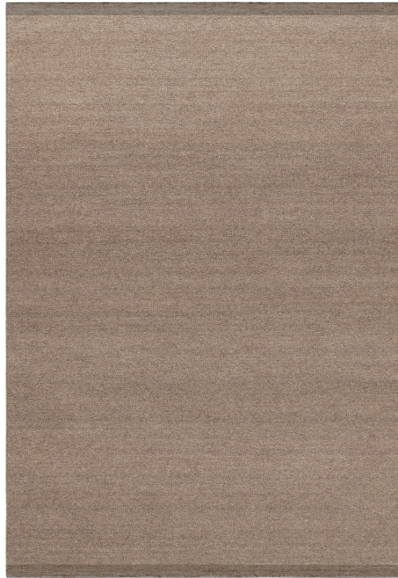
Zero - Brown

The Zero Collection is a celebration of wool in its most pure state. Durable hand woven rugs made with great quality European wool, with zero dye — uncolored — to reveal the natural characteristics of the raw fibres. This timeless minimalist statement comes in five different shades, and the secret recipe behind each is simply different colored sheep.