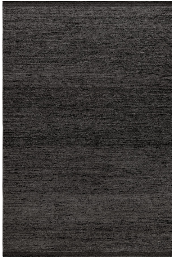
Zero - Anthractie Mix

The Zero Collection is a celebration of wool in its most pure state. Durable hand woven rugs made with our best quality New Zealand wool, with zero dye — uncoloured — to reveal the natural characteristics of the raw fibres. This timeless minimalist statement comes in five different shades, and the secret recipe behind each is simply different coloured sheep.