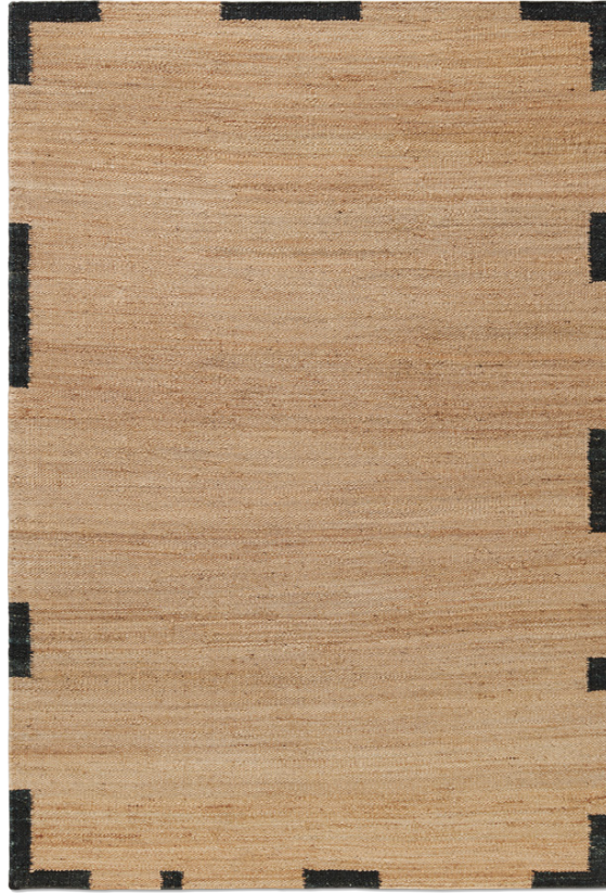
Jute Edge - Black

The Jute Collection is woven with strong all-natural plant fibers in a modern rustic design. Equally as rugged as minimalist. Available in three different patterns using our signature cream, teal, and black colors as accents. The rugs are a beautiful foundation to any room, whether it's in the countryside or in the city. Each rug is handwoven with irregular details to create beautiful imperfections that make each rug unique. The rugs are tough and durable with a texture that ages beautifully.