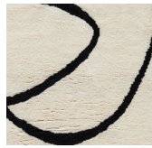
Simple Object 18