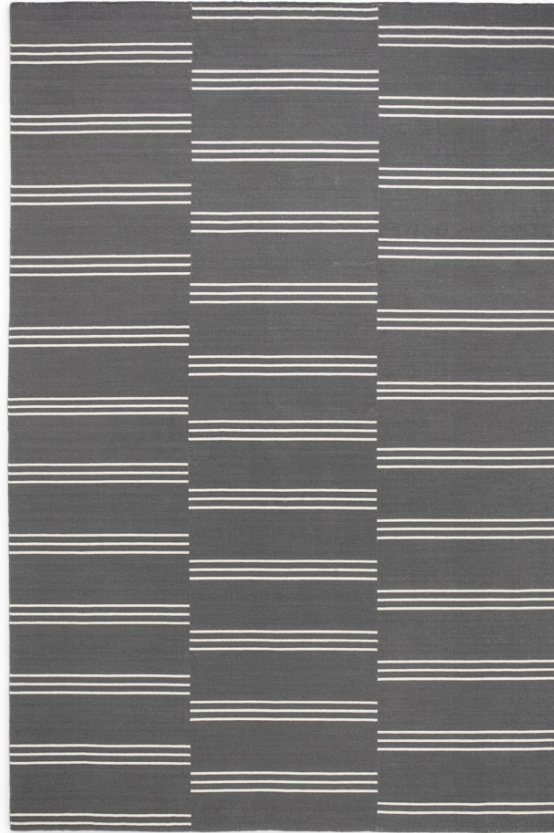
Stripes - Gray/Cream

The brick patterned stripes gives the rug a unique expression and the soft colors beautifully complements its surroundings. This rug is skillfully hand loomed in high quality New Zealand wool for a soft feel that will last a lifetime. It is woven straight through so you can use both sides of the rug, should you need to.