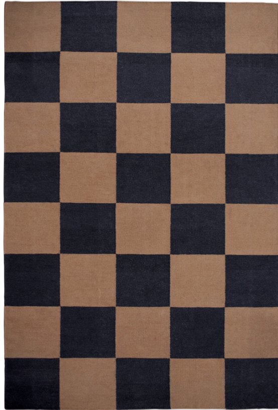
Square - Tobacco

A classic design that gives a sophisticated first and lasting impression. The soft color combination is easy to decorate with and hard not to love. This rug is skillfully hand woven in high quality New Zealand wool for a soft feel that will last a lifetime. It is woven straight through so you can use both sides of the rug, should you need to.