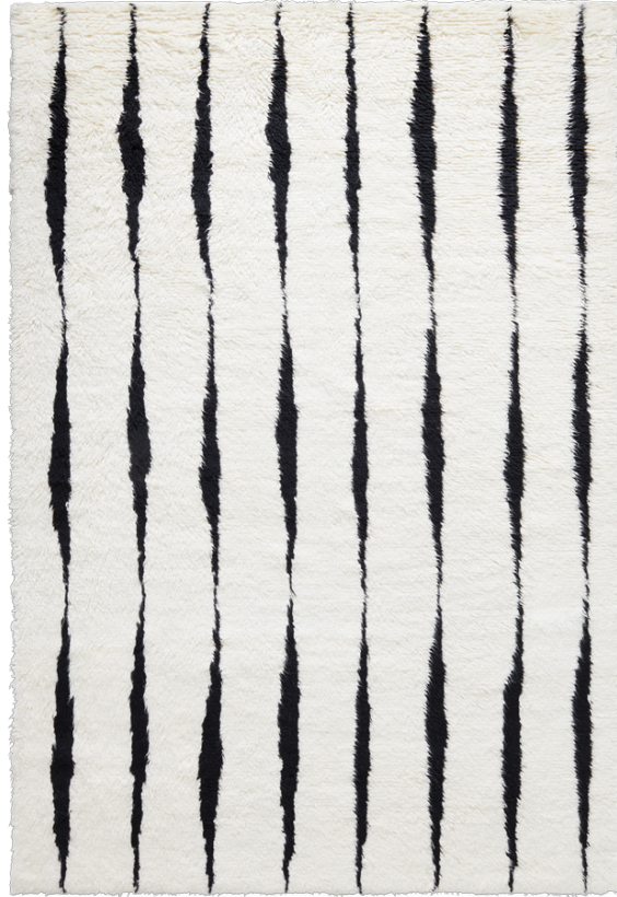
Fjord - Cream/Black

A fjord or fiord is a long, narrow inlet with steep sides or cliffs, created by a glacier. This design is inspired by the Norwegian coastline and it's estimated 1,200 fjords. This shaggy rug is made with New Zealand wool for great quality and a soft feel.