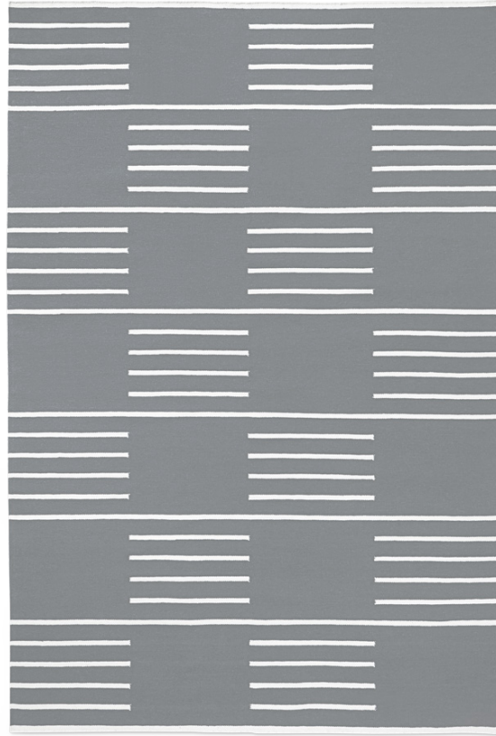
Classic - Gray/Cream

A traditional design inspired by classic Scandinavian patterns. The rug is available in contrasting colors and a tone on tone for a more or less lively look. This rug is skillfully hand woven in high quality New Zealand wool for a soft feel that will last a lifetime. It is woven straight through so you can use both sides of the rug, should you need to.